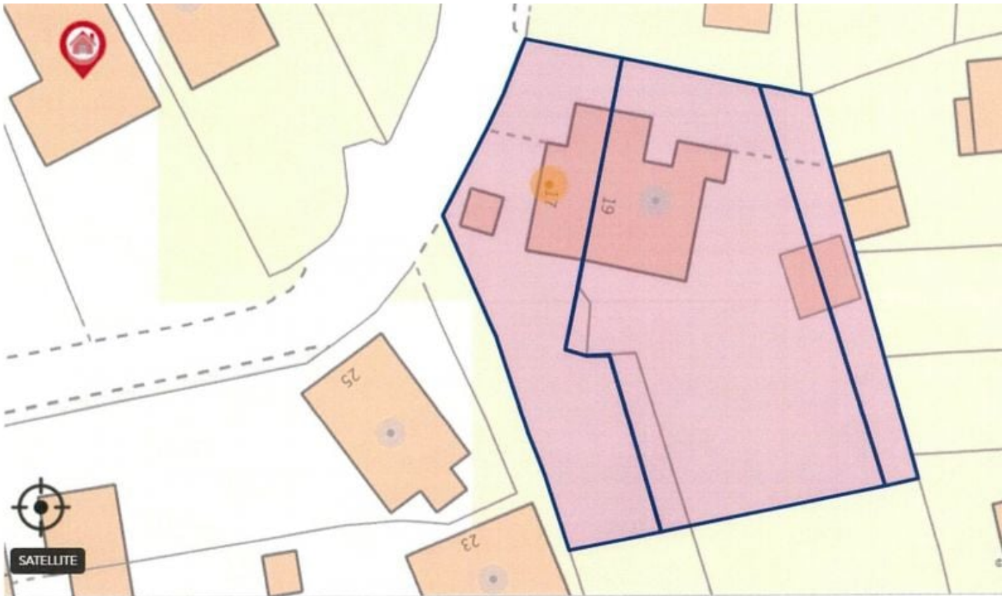
Site Plan - SY366260, SY595687

Whilst every attempt has been made to ensure the accuracy of the floorplan contained here, measurements of doors, windows, rooms and any other items are approximate and no responsibility is taken for any error, omission or mis-statement. This plan is for illustrative purposes only and should be used as such by any prospective purchaser. The services, systems and appliances shown have not been tested and no guarantee as to their operability or efficiency can be given. Made with Metropix 6/2024